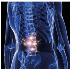
Relieves back strain, maintains health

Pneumatic tires, free-swinging bucket holder, bucket lock, collapsible.