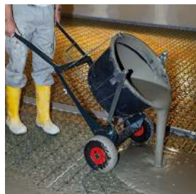
The bucket lock makes pouring the material effortless.