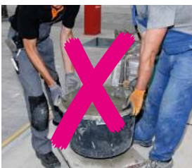
That's over now!