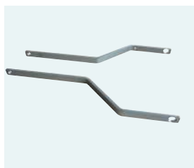
60318: Upgrade kit for 90-liter bucket